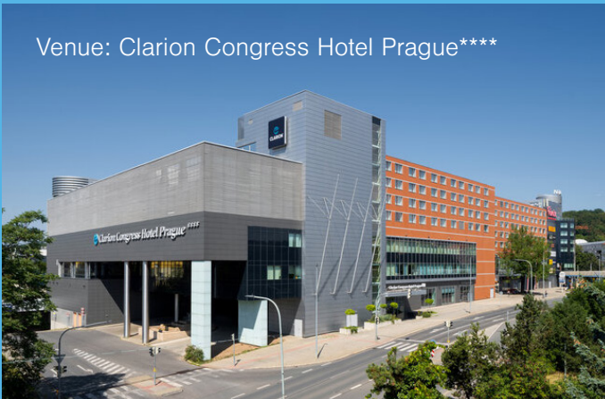
Venue: Clarion Congress Hotel Prague****

ETCC 2026 offers a range of Sponsorship Packages and Exhibition Opportunities designed to help you effectively reach your target audience at the Congress and maximise your impact.